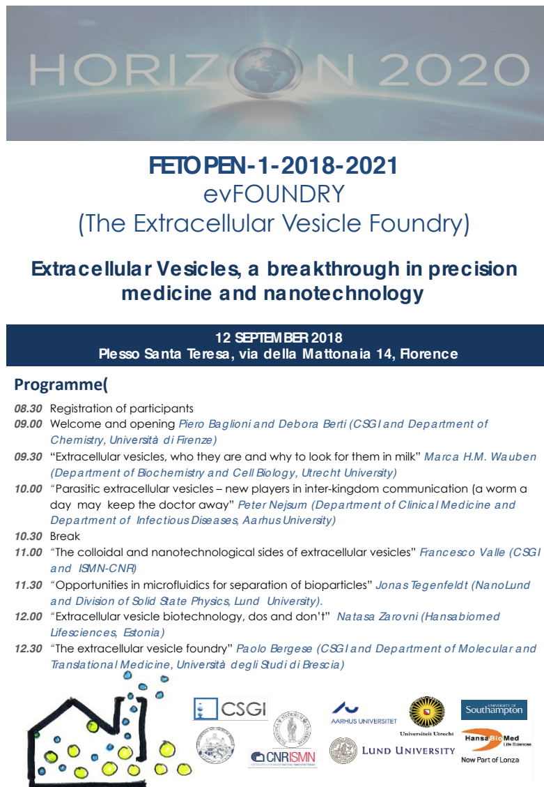
Figure 5. Flyer of the workshop “Extracellular Vesicles, a breakthrough in precision medicine and nanotechnology” (September 12 th , Florence).