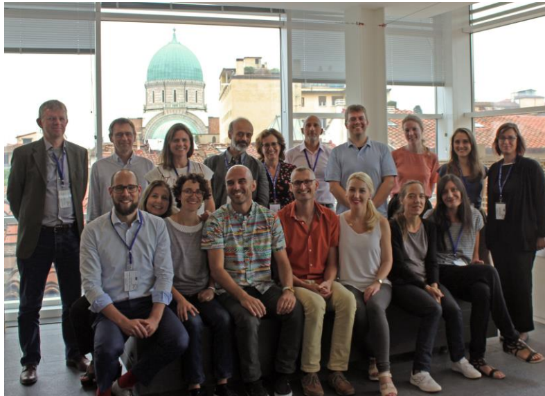
Figure 4. Participants to the evFOUNDRY Kick of Meeting (September 12 th -13 th , 2018, Florence).